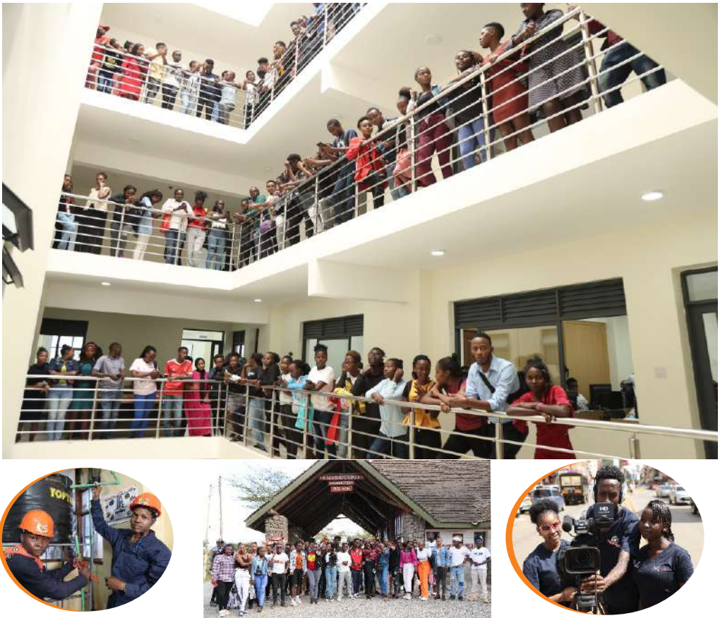
The Leading TVET & Medical Institution in Kenya